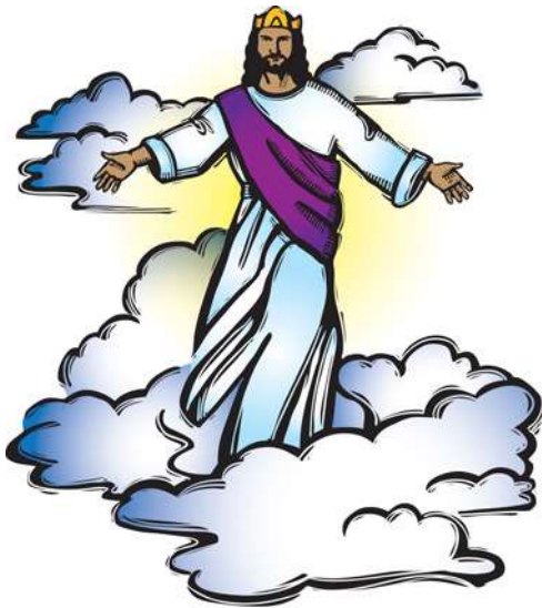
The Second Coming of Christ

3. What will the second coming of Jesus be like?